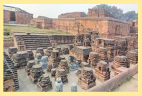
Photography of the remains of Nalanda by Anushka Mukherjee, class IX